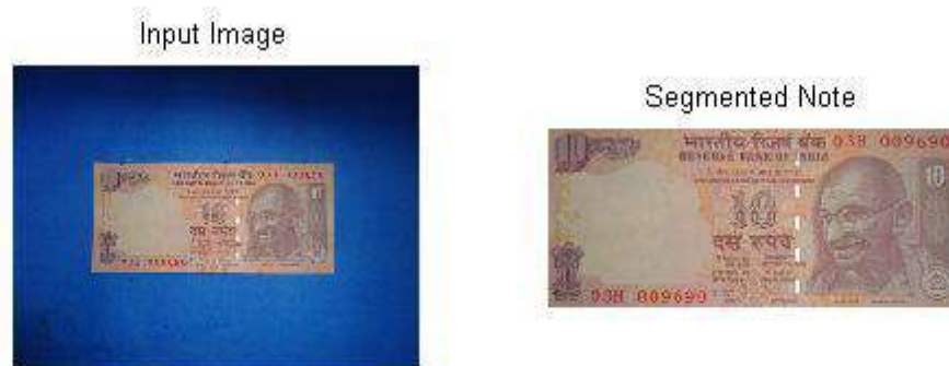
Figure 1. Paper currency segmentation result

A digital camera or scanner or phone is used for image preprocessing. The starting step of the paper currency recognition system would be image segmentation that means separating the note image from the background. Figure 1 shows an example of segmentation, involved in this work.