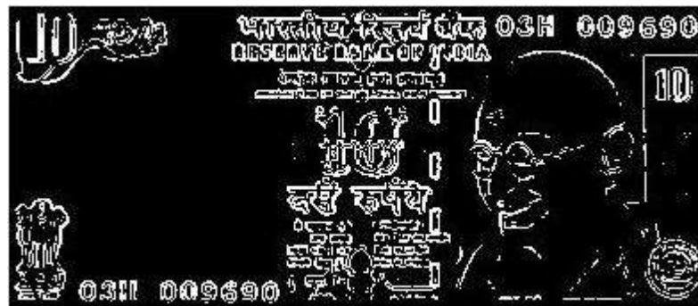
Figure 2. Edge detection result

It is the preparatory step of template matching. Edge detection of the database note and input note, which is about to be matched is performed. Figure 2 shows an example for the result of edge detection method which is involved in this work. The edges of input and database notes are coordinate to obtain a correlation coefficient. This coefficient is the matching score obtained by matching input and database notes.