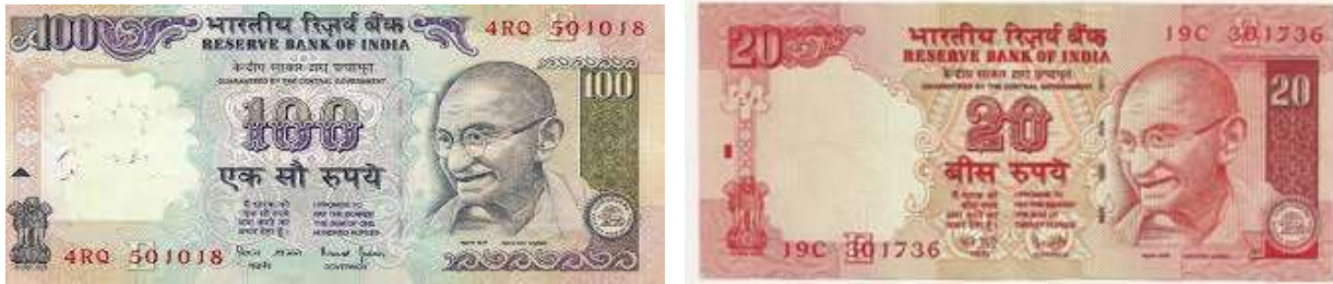
Fig 3. Different denomination Currency.

Threshold comparison. The matching score obtained from each matching dimension database note is compared with a predefined threshold value. If the matching score is greater than threshold, the particular database note stands matched with the input note. Otherwise, the particular database note stands unmatched.